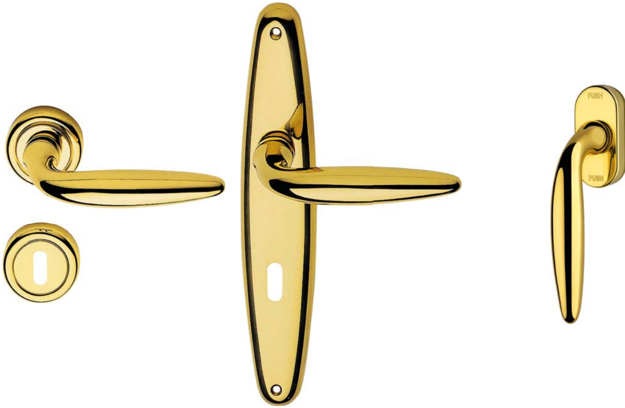
COD. 930 RB 103