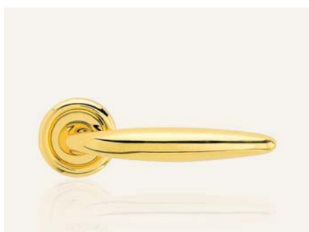
OL ottone lucido verniciato polished brass