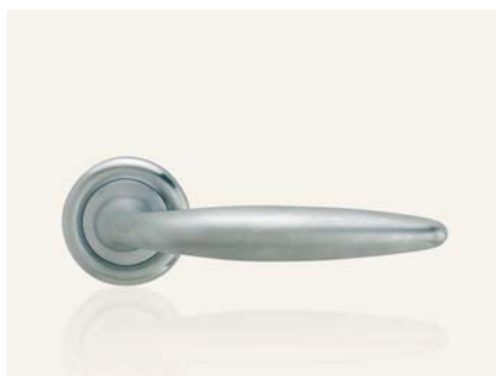
CS cromo satinato satin chrome