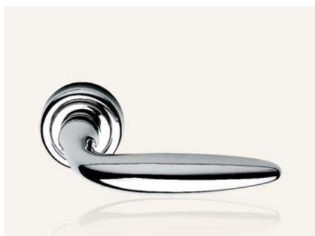
CR cromo lucido polished chrome