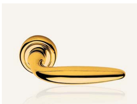
OZ oro zecchino gold plated