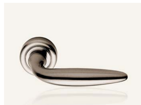
NS nickel satinato satin nickel